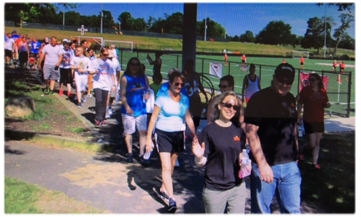
Walk participants at this past year's Jersey Shore 5K for Kidneys