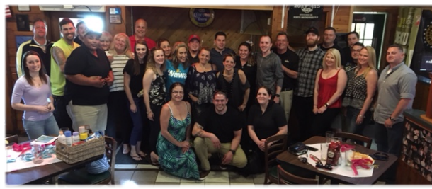
Team WAWA, our main sponsor, held their annual Pub Night and donated $9,000+ to the Foundation. THANK YOU, WAWA!